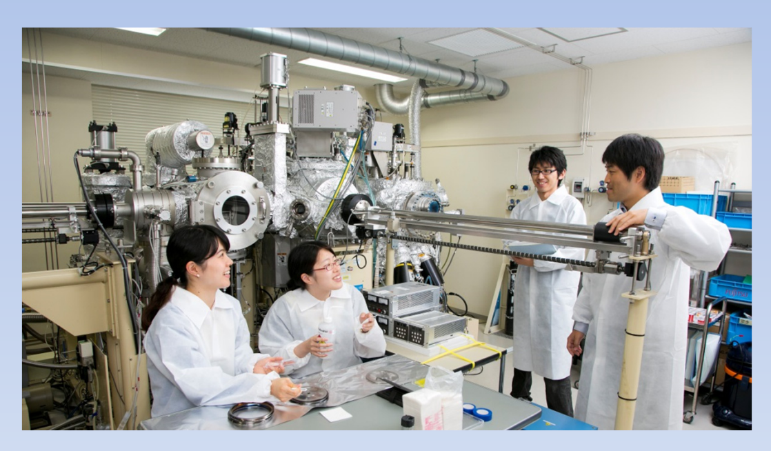
Nano-fabrication experiments using ultra high vacuum multiple targets sputtering.

Key Words; Magnetic thin films, Epitaxial film process, Giant uniaxial magnetic anisotropy, High density magnetic recording, Innovative permanent magnet