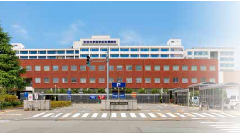
University Hospital (Front entrance)

The University Hospital is not only an educational and research facility, but it is also the core health care facility in the community, employing full use of its medical functions through an abundance of knowledge that covers each medical discipline and the most up-to-date medical equipment. In 1994 it was designated as a Specific Function Hospital, and as a hospital that takes on a leadership role in the community, we shall continue to strive to further our efforts to contribute to society.