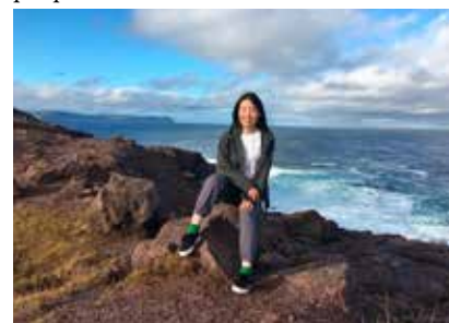
Akita university student in Canada

With government border control restrictions lifted and overseas travel expected to recover, we are strengthening our framework for the development of human resources with an international perspective.