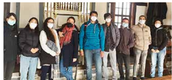
Akita University student in Germany (second from left)

For more information on Akita University’s international exchange initiatives, please refer to the following website.