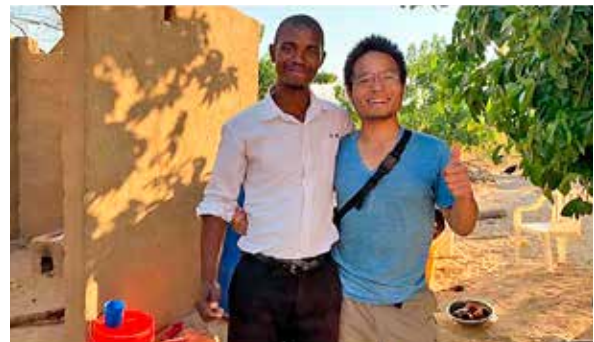
Akita students studying in Zambia (right)

There are also other study abroad programs providing scholarships as part of the Japan Student Services Organization (JASSO) “Overseas Study Support Program.”