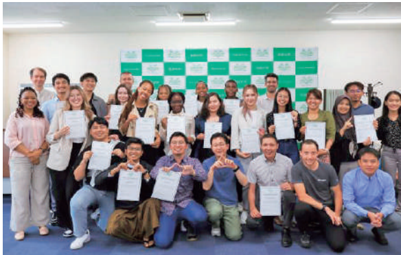
Completion Ceremony for the Short Stay Program