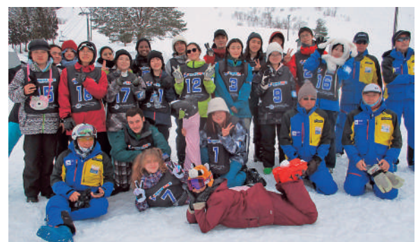
Ski camp for international students

For more information on Akita University's international exchange initiatives, please refer to the following website.