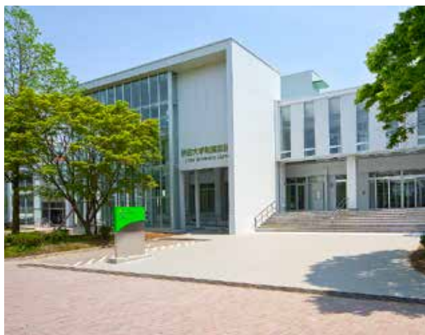
Central Library (main entrance)

● The two University Libraries (the Central Library on Tegata Campus and the Medical Library on Hondo Campus), provide books, academic journals, audio-visual materials, electronic information, and other study materials for student use, while systematically managing and maintaining the collection.