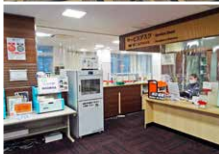
Service desk and book sterilizer