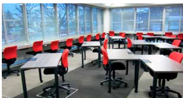
Medical Library "Commons"