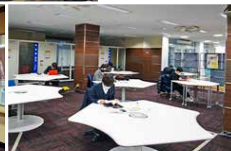
Central Library "Commons"