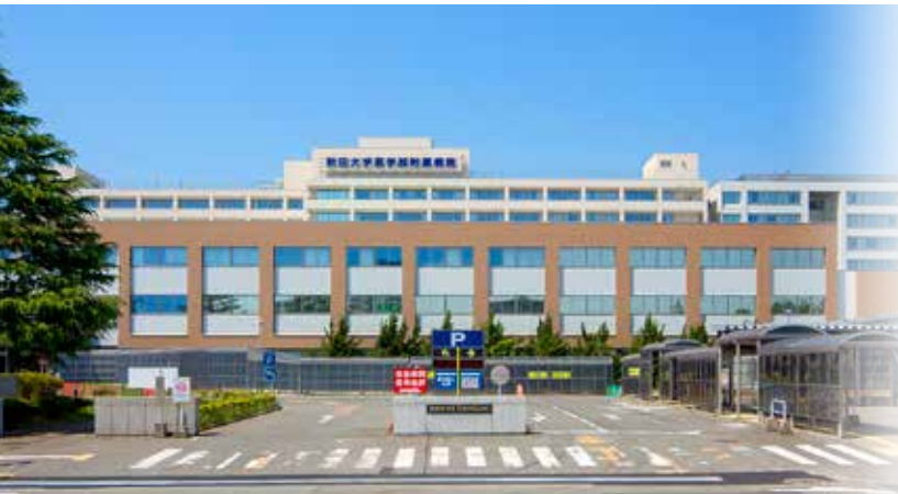
University Hospital (Front entrance)

The University Hospital is not only an educational and research facility, but it is also the core health care facility in the community. The hospital makes full use of its medical capabilities through an abundance of knowledge that covers each medical discipline and the most up to-date medical equipment. In 1994 it was designated as a Specific Function Hospital, and as a hospital that takes on a leadership role in the community, we shall continue to strive to further our efforts to contribute to society. Furthermore, while we are actively trying to fulfill our role in training excellent medical staff and furthering medical research through providing adequate, high-quality, advanced medical care in an environment where patients can feel secure, we are also taking on a role central to community healthcare and healthcare related activities. We also strive to further our contributions globally.