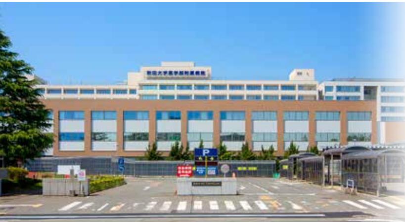
University Hospital (Front entrance)

The University Hospital is not only an educational and research facility, but it is also the core health care facility in the community. The hospital makes full use of its medical capabilities through an abundance of knowledge that covers each medical discipline and the most up to-date medical equipment. In 1994 it was designated as a Specific Function Hospital, and as a hospital that takes on a leadership role in the community, we shall continue to strive to further our efforts to contribute to society. Furthermore, while we are actively trying to fulfill our role in training excellent medical staff and furthering medical research through providing adequate, high-quality, advanced medical care in an environment where patients can feel secure, we are also taking on a role central to community healthcare and healthcare related activities. We also strive to further our contributions globally.