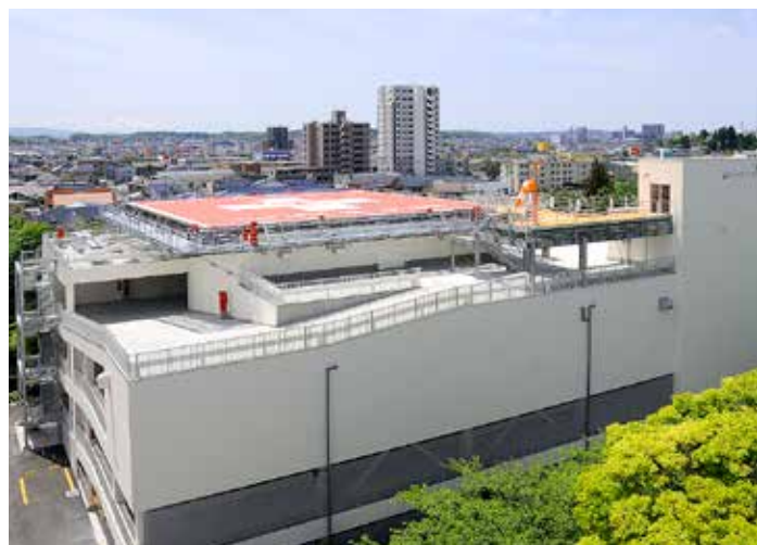
Helipad and Multistory parking lot