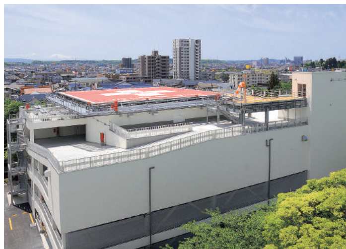
Helipad and Parking Garage