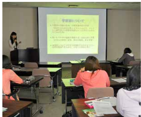
Study Abroad Orientation (May 22, 2013)

Also, in an effort to provide financial support to university students studying abroad at partner schools we have established the "Akita University Student Overseas Assignment Support Project". Part of the international airfare is provided (up to 40,000 yen within Asia, and up to 100,000 for other locations), with support provided to 5 students in FY2013.