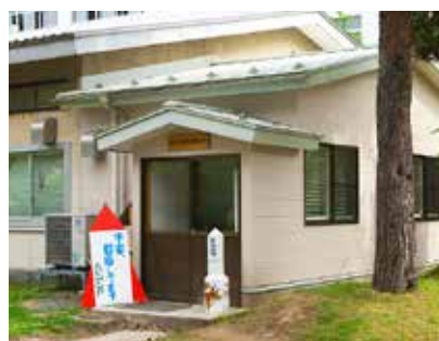
〈Graduate School of Engineering and Resource Science〉

Global Environment Research section, Environmentally-friendly Materials, Process Research section