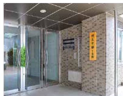
〈Graduate School of Engineering and Resource Science〉

Student-centered projects, Manufacturing classes for children, Manufacturing classes for adults, License lectures, Manufacturing lecture series, Noshiro Space Event, Akita Space Consortium, Manufacturing supply center