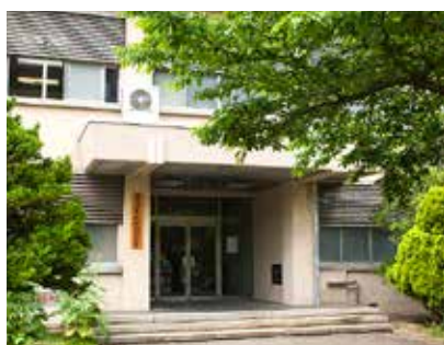
〈Graduate School of Engineering and Resource Science〉