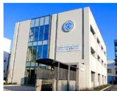
〈Faculty of Medicine〉