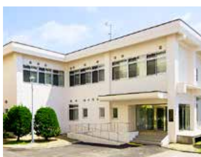
〈Faculty of International Resource Sciences〉