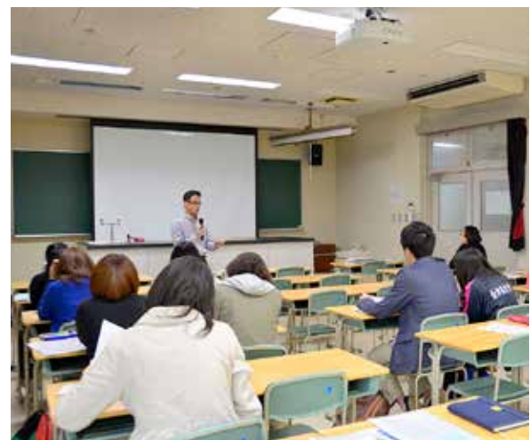
Study Abroad Orientation (May 23, 2014)

Also, in an effort to provide financial support to university students studying abroad at partner schools we have established the “Akita University Student Overseas Assignment Support Project.” Part of the student’s international airfare is paid for (up to 40,000 yen within Asia, and up to 100,000 for other locations), with support provided to 5 students in 2013.