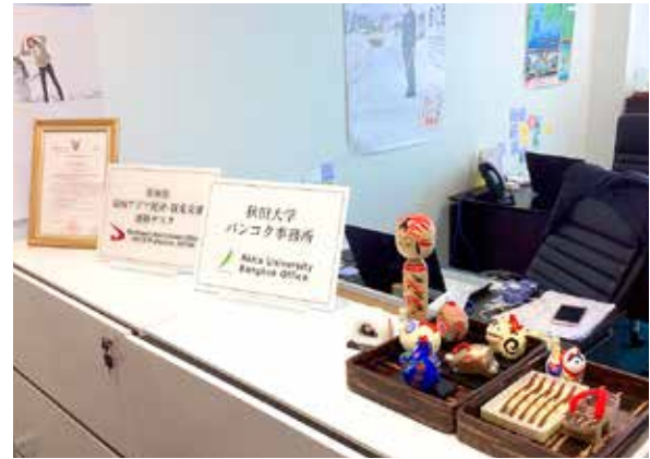
Akita University Bangkok Office (October 2014)

Our present network of inter-university agreements consists of 55 universities in 29 countries and regions. Our network of inter-departmental agreements consists of 15 departments in 8 different countries and regions (as of April 1, 2015). In October 2012, the overseas base “Akita University Mongolia Office” was opened. In April 2013 the second overseas base “Akita University - Chulalongkorn University Joint Research Laboratory” was opened at Chulalongkorn University in Thailand. In October 2014, the Akita University Bangkok Office was opened within the Bangkok Branch of Hokuto Bank (Kingdom of Thailand). We will continue to be proactive in promoting international exchange through academic partnerships and student interaction with our partner schools.