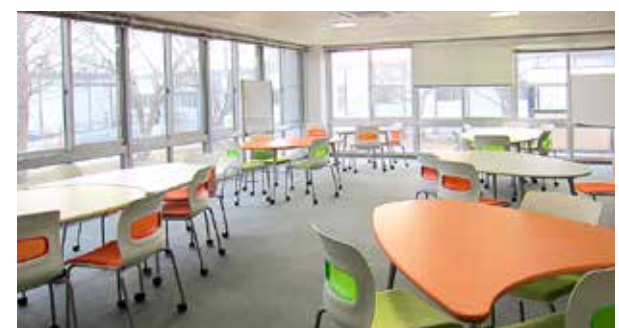
Medical Library "Commons"