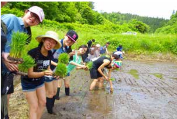
Students experienced rice planting

In April 2010, the “Multicultural Lounge” was established as a space to independently study a variety of languages, and study abroad orientation and information meetings are regularly held here.