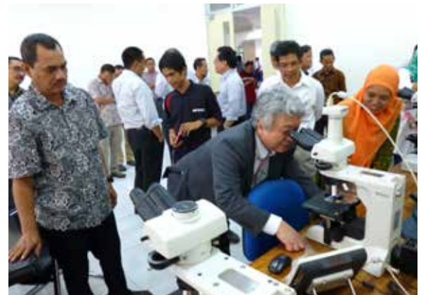
Hasanuddin University Joint Research Laboratory

By establishing research bases in Indonesia, we hope for increased growth in the study and development of the region, focused on joint research into Asia's underground resources.