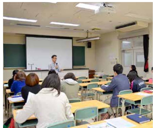
Study Abroad Orientation (May 23, 2014)

Also, in an effort to provide financial support to university students studying abroad at partner schools we have established the “Akita University Student Overseas Assignment Support Project.” Part of the student’s international airfare is paid for (up to 40,000 yen within Asia, and up to 100,000 for other locations), with support provided to 5 students in 2015.