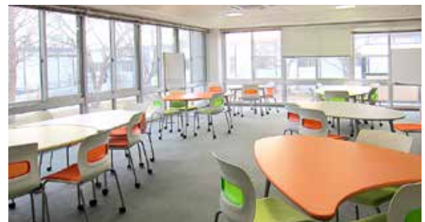
Medical Library "Commons"