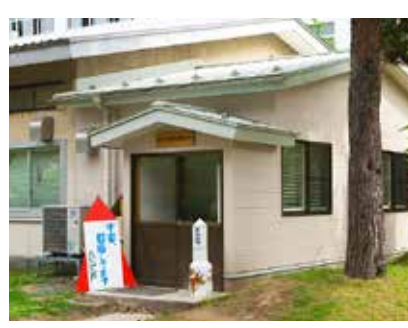
〈Graduate School of Engineering and Resource Science〉