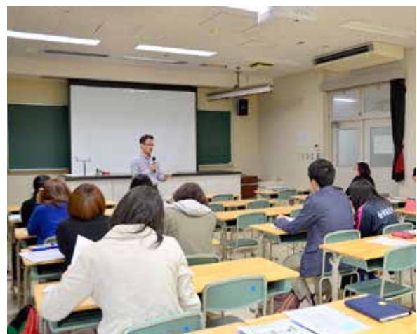
Study Abroad Orientation (May 23, 2014)

Also, in an effort to provide financial support to university students studying abroad at partner schools we have established the “Akita University ‘Building the Future’ Fund: Student Overseas Assignment Support Project”. Part of the student’s international airfare is paid for (up to 40,000 yen within Asia, and up to 100,000 for other locations), with support provided to 5 students in 2016.