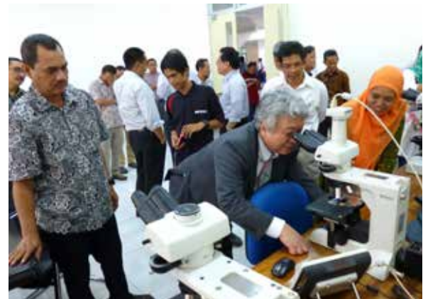
Hasanuddin University Joint Research Laboratory

By establishing research bases in Indonesia, we hope for increased growth in the study and development of the region, focused on joint research into Asia's underground resources.