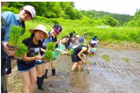
Students experienced rice planting

In April 2010, the “Multicultural Lounge” was established as a space to independently study a variety of languages, and study abroad orientation and information meetings are regularly held here.