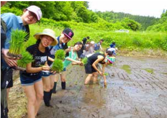
Students experienced rice planting

In April 2010, the "Multicultural Lounge" was established to enable students and faculty staff to independently study a variety of different languages.