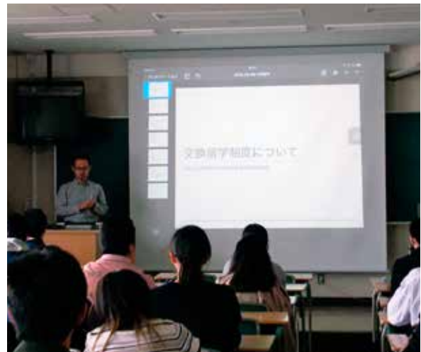
Study Abroad Orientation

Also, in an effort to provide financial support to university students studying abroad at partner universities we have the "Akita University 'Miraisozo Fund': Student Overseas Visit Project". A part of student's international airfare is paid for (up to 40,000 yen within Asia, and up to 100,000 for other locations), with support provided to 4 students in 2017.