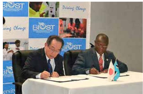
Signing at the opening ceremony

In 2017, we opened the Akita University Botswana Office in the Botswana International University of Science and Technology. As well as conducting research and educational activities in the South Africa region, this is used as a base in the region for the required "International Resource Fieldwork" course in the 3rd grade of the Faculty of International Resource Sciences.