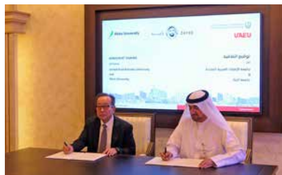
A signing at the UAE University

In April 2019, we set up the Akita University-UAE University Joint Laboratory at the United Arab Emirates University and the Akita University-Padjadjaran University Joint Laboratory at the Padjadjaran University in Indonesia. The Akita University-UAE University Joint Laboratory serves as our hub in the Middle East, focusing on educational research activities in resource science fields and joint research programs, for example on geothermal heat utilization technology. The Akita University-Padjadjaran University Joint Laboratory is a hub for joint research on resource science subjects and fieldwork by researchers and students of the University, and also serves as the operational hub for the University’s first double degree program (Graduate School of International Resource Sciences and the Padjadjaran University).