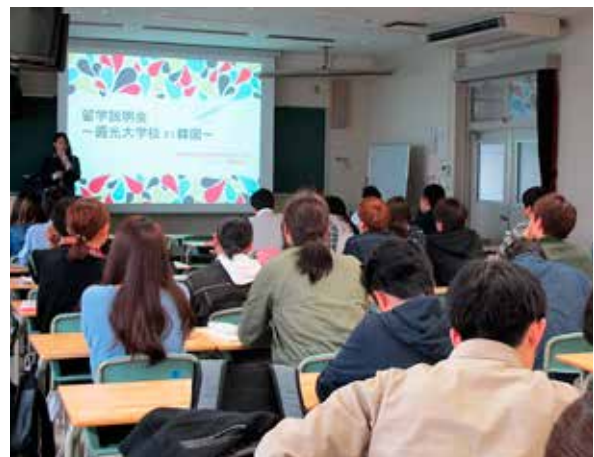
Study Abroad Orientation

Also, in an effort to provide financial support to university students studying abroad at partner universities we have set up the "Akita University 'Miraisozo Fund': Student Overseas Visit Project" and the "Akita University Overseas Student Short-term Training Fund." These can be used to pay a part of students' international outbound airfares (up to 40,000 yen within Asia, and up to 100,000 for other locations). The projects provided support to eight students in 2018.