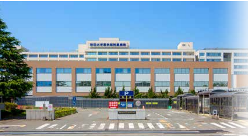
University Hospital (Front entrance)

The University Hospital is not only an educational and research facility, but it is also the core health care facility in the community. The hospital makes full use of its medical capabilities through an abundance of knowledge that covers each medical discipline and the most up to-date medical equipment. In 1994 it was designated as a Specific Function Hospital, and as a hospital that takes on a leadership role in the community, we shall continue to strive to further our efforts to contribute to society. Furthermore, while we are actively trying to fulfill our role in training excellent medical staff and furthering medical research through providing adequate, high-quality, advanced medical care in an medical environment where patients can feel secure, we are also taking on a role central to community healthcare and healthcare related activities. We also strive to further our contributions globally.