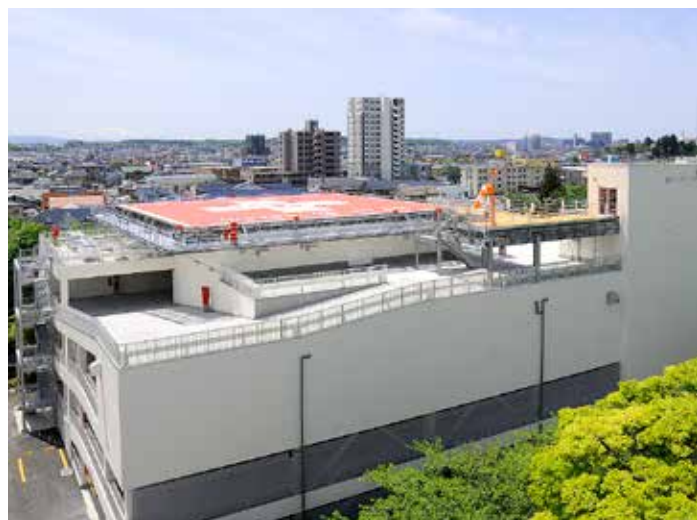
Helipad and Multistory parking lot